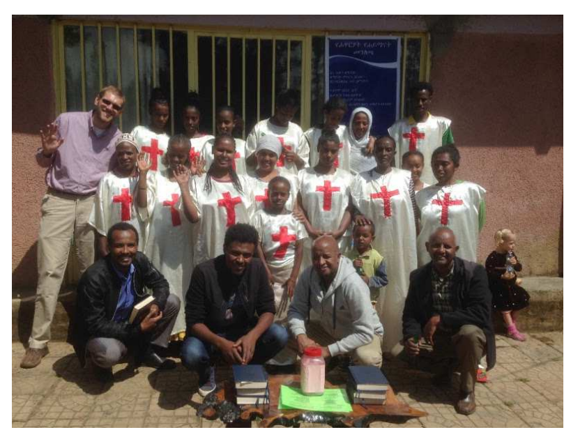
New Brothers and Sisters in Christ

This past Sunday we celebrated a special baptism service in which sixteen new members were received into Suki Fellowship. Each robed person in this picture represents a unique story of God working to draw people to Himself. The four